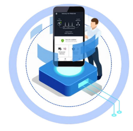
Easy to Deploy and Manage