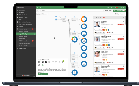
Intuitive easy to use view into the network and endpoint vulnerabilities