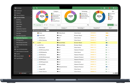
Visibility with FOS Application Signatures