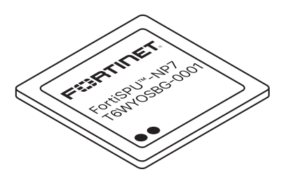
Network Processor 7 NP7

Network Processors operate inline to deliver unmatched performance and scalability for critical network functions. Fortinet's breakthrough SPU NP7 network processor works in line with FortiOS functions to deliver: