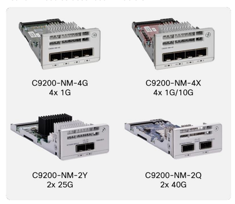
Figure 2. Cisco Catalyst 9200 Series Switch network modules

Cisco Catalyst 9200 Series switches come with modular or fixed uplinks as indicated in Table 1. With modular SKUs, the field-replaceable network modules provide infrastructure investment protection by allowing a nondisruptive migration from 1G to 10G and beyond. When you purchase the switch, you can choose from the network modules described in Table 3.