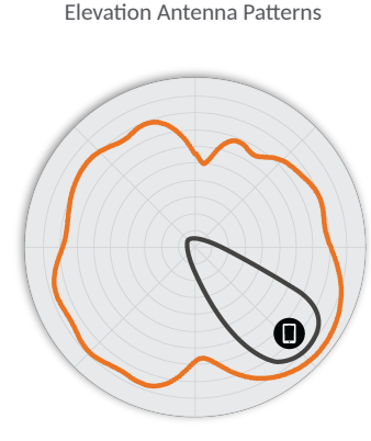
Figure 4. R550 2.4GHz