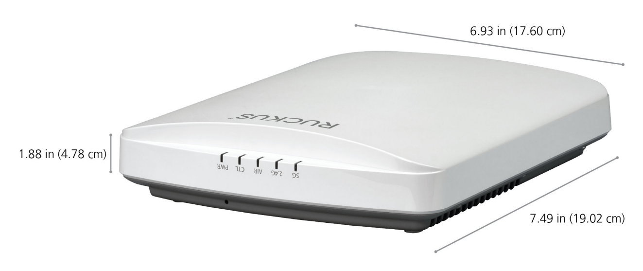
Weight: 1.24 lbs (0.562 kg)